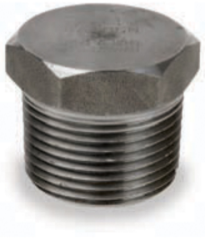
Fig. 42HP3 – Hex Head Plug